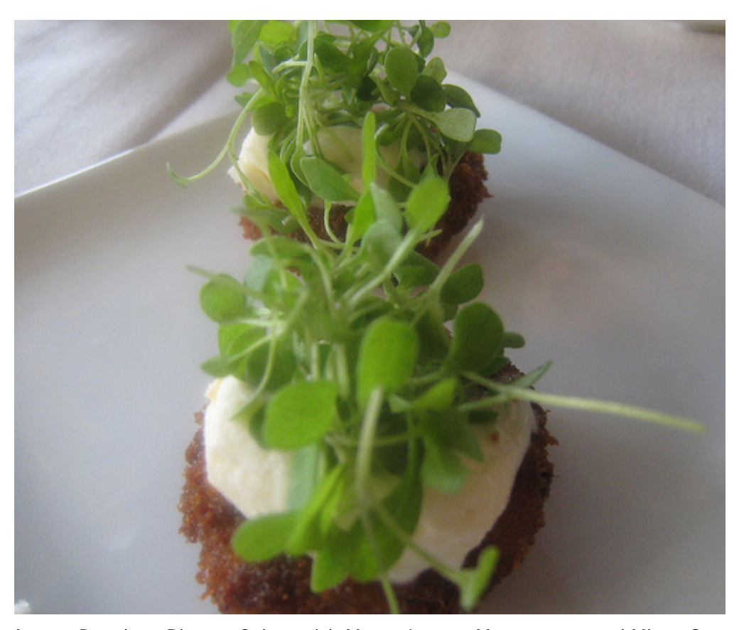
Amuse Bouche - Risotto Cakes with Meyer Lemon Marscapone and Micro Greens